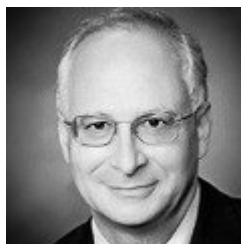
From the TBS President